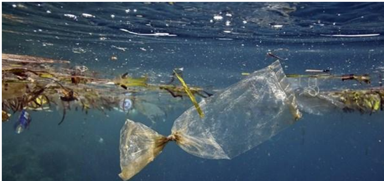
Plastic waste under the sea.