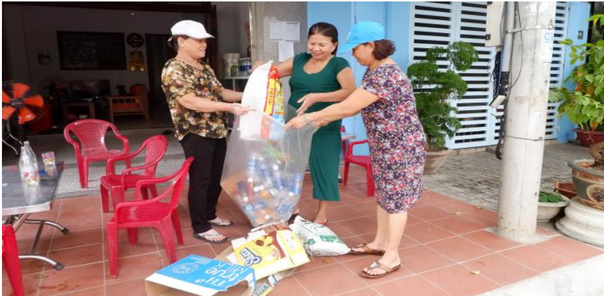
Model for Resource Waste Recycling

restaurants, service establishments, shipowners, youth groups, and schools (3) large environmental events and policy forums on plastic waste management.