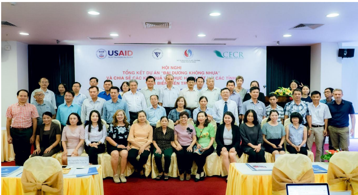
Conference Summarizing the Project "Non-plastic Ocean" and Sharing the Results and Good Practices with the Central Coastal provinces