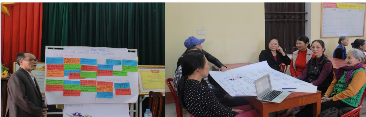
Discuss the impacts of climate change on Ninh Binh with local people

Financial report: 49,280,000 VND ~ 70,062 baht