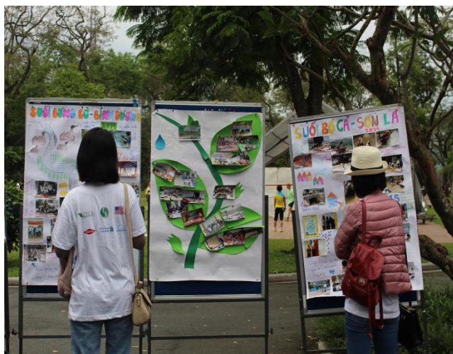
Earth Day 2017